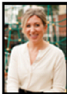
Designated Safeguarding Person