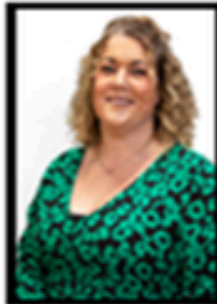
Deputy Designated Safeguarding Lead