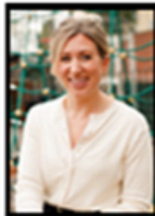
Designated Safeguarding Person