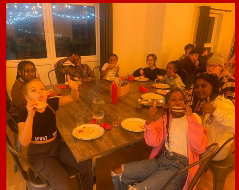
The Briars Photo Album November 2022